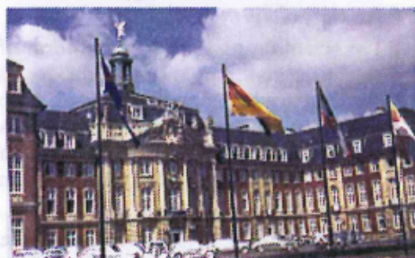
Venue of the 2 nd EMN-Congress and the 3 rd International Exhibition „Sculptures Project 1997“.