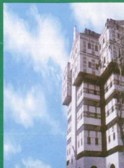
The New building of the Burdenko Neurosurgical Institute

The "call for papers" deadline is april 15, 2000 for free communications, posters and videos. Please send the type written form for English or French abstract to Prof. J. L. Truelle. Selection will be made until june 1, 2000. Abstracts will be assembled in a folder for distribution to participants. Papers will be published in English on the web.