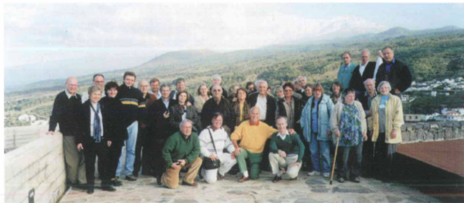
The EMN family's outing in the mountains of Tenerife after a very successful 4th congress 1999

Our EMN society is now five years old, not very old for a scientific association. All the same, the experience that we have made in these five years does permit us to make some predictions for the future. All those of us who took part at the Zurich and Tenerife congresses fully agree that extremely gratifying progress has been made, both in terms of the membership figures as well as, in particular, the scientific contents and the social contacts. This also became apparent at the joint meeting with the ICRAN society in Magdeburg (1998) and the joint 2000 An-