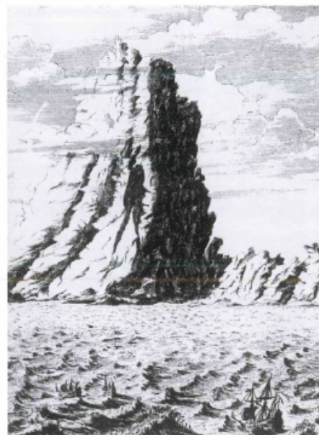
The Pico del Teide, distinctive sign of the Canary Islands and the highest Spanish mountain, seen as bizarre vision by an unknown engraver in the early 18. century

The Euroacademia was created with the main aim of being a forum for discussion of all these topics with the co-operation of different specialists and experts. When we look back to past meetings, look at the Tenerife meeting and look forward to the next meeting I believe that the Euroacademia is moving in the right direction towards achieving its aims, covering all the aspects of injuries to the nervous system in a balanced way. What has been discussed in the four main scientific sessions: general aspects, acute period, fronto-basal injuries and guidelines is reflected in this book. No further comments on