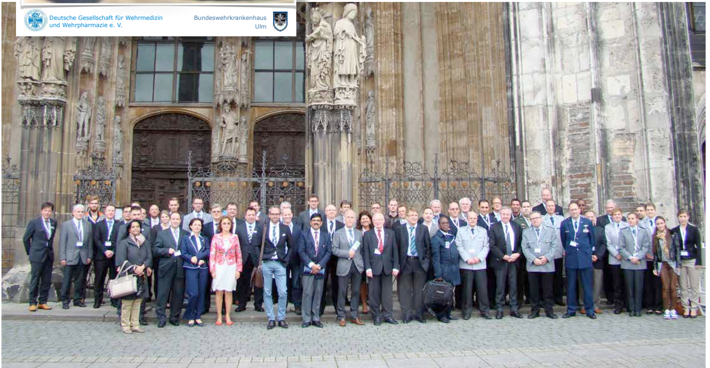
The participants in front of the cathedral in Ulm

It was a special highlight that our Annual Congress of EMN was held in cooperation with the 1 st WFNS Committee Meeting of Military Neurosurgeons. Colleagues of different European military forces participated in our congress with interesting lectures and furthermore they chaired our sessions.